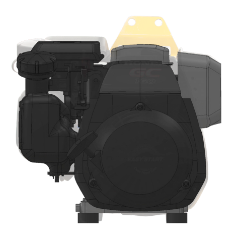
Brushless Industrial Genend with clean power